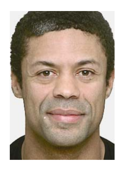
Not acceptable The subject is too close to the camera