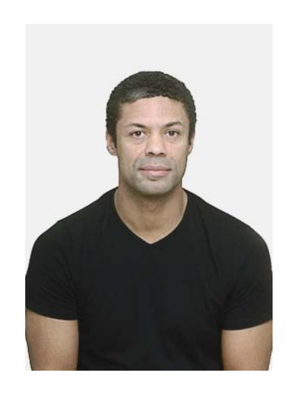
Not acceptable The subject is too far from the camera